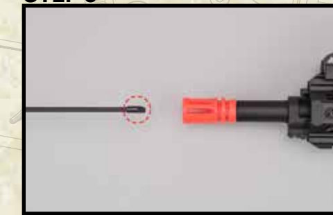
Insert the cleaning rod into the barrel to remove the jammed BBs.