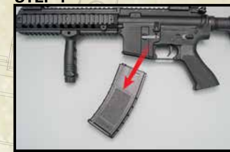
Remove the magazine.