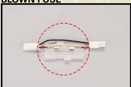
Please check the fuse.