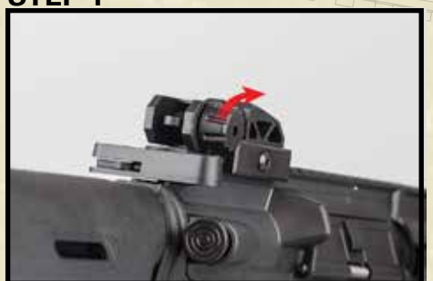
Put sight up