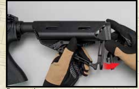
Remove the cover.