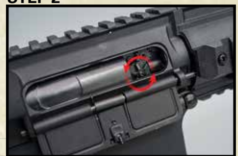
Turn off the hop up by rotating the hop up dial (Counter Clockwise) all the way towards normal.