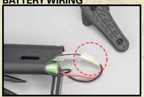
Please check the connectors.