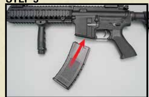
Insert the magazine until you hear it click into place. The gun is now ready to fire.