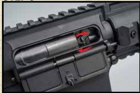
To increase the hop up setting, rotate the hop up dial (Clockwise) towards hop.