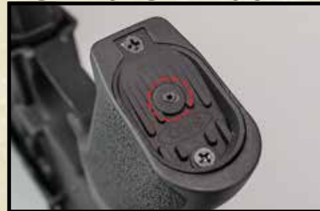
Please use an allen to adjust motor height.