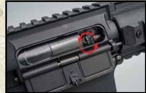
To reduce the hop up setting, rotate the hop up dial (Counter Clockwise) towards normal.