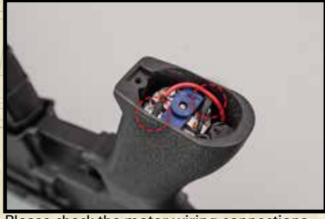
Please check the motor wiring connections.