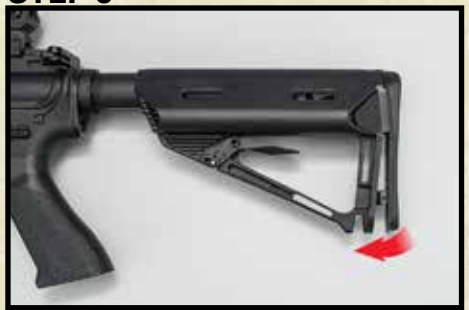
Reinstall the cover