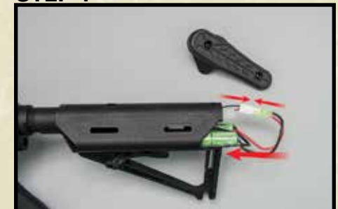
Connect the battery leads. Insert the battery into the stock.