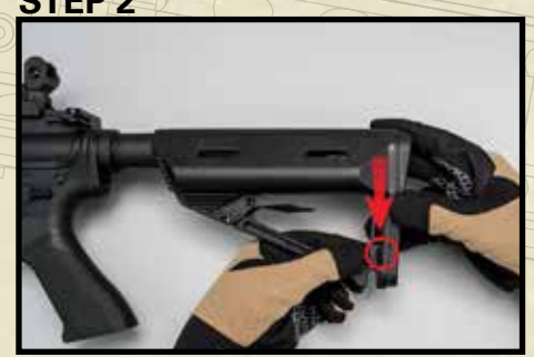
Push the release button.