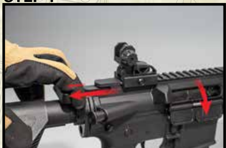
Pull the charging handle to the rear, exposing the hop up lever.