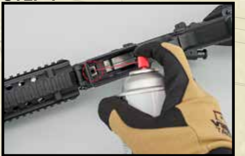
Use airsoft safe silicone to lubricate the hop up chamber. Use sparingly.