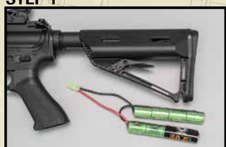
Please use a fully charged 8.4v or 9.6v NIMH battery.