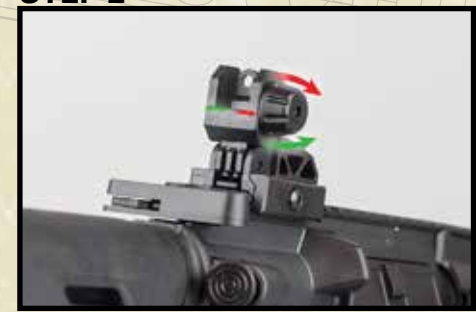
Rotate dial to adjust the sight left or right

WRONG Hop up set to high, rotate the dial towards normal (Counter Clockwise)