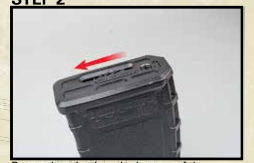
Rotate the wheel on the bottom of the magazine until you hear the clicking sound change.