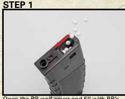
Open the BB well cover and fill with BB's, then close the well cover.